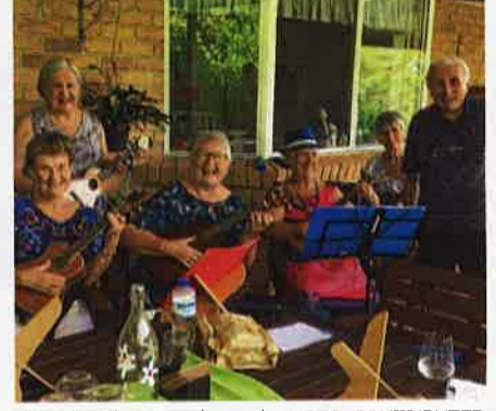
The Uka-lalians in rehearsal.